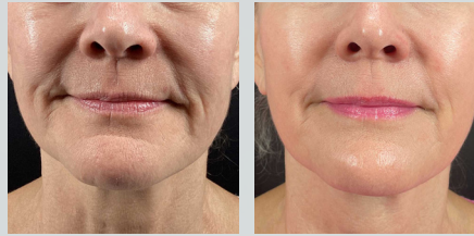
ESMÉ THE MEDSPA