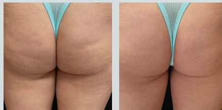
DIAMOND ADVANCED AESTHETICS, NYC